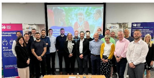
2024 Programme cohort

To find out more about Well School - Well Schools - Wellbeing Resources - Youth Sport Trust